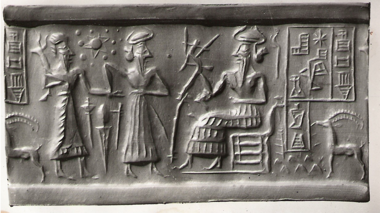
Figure 1: VA-243