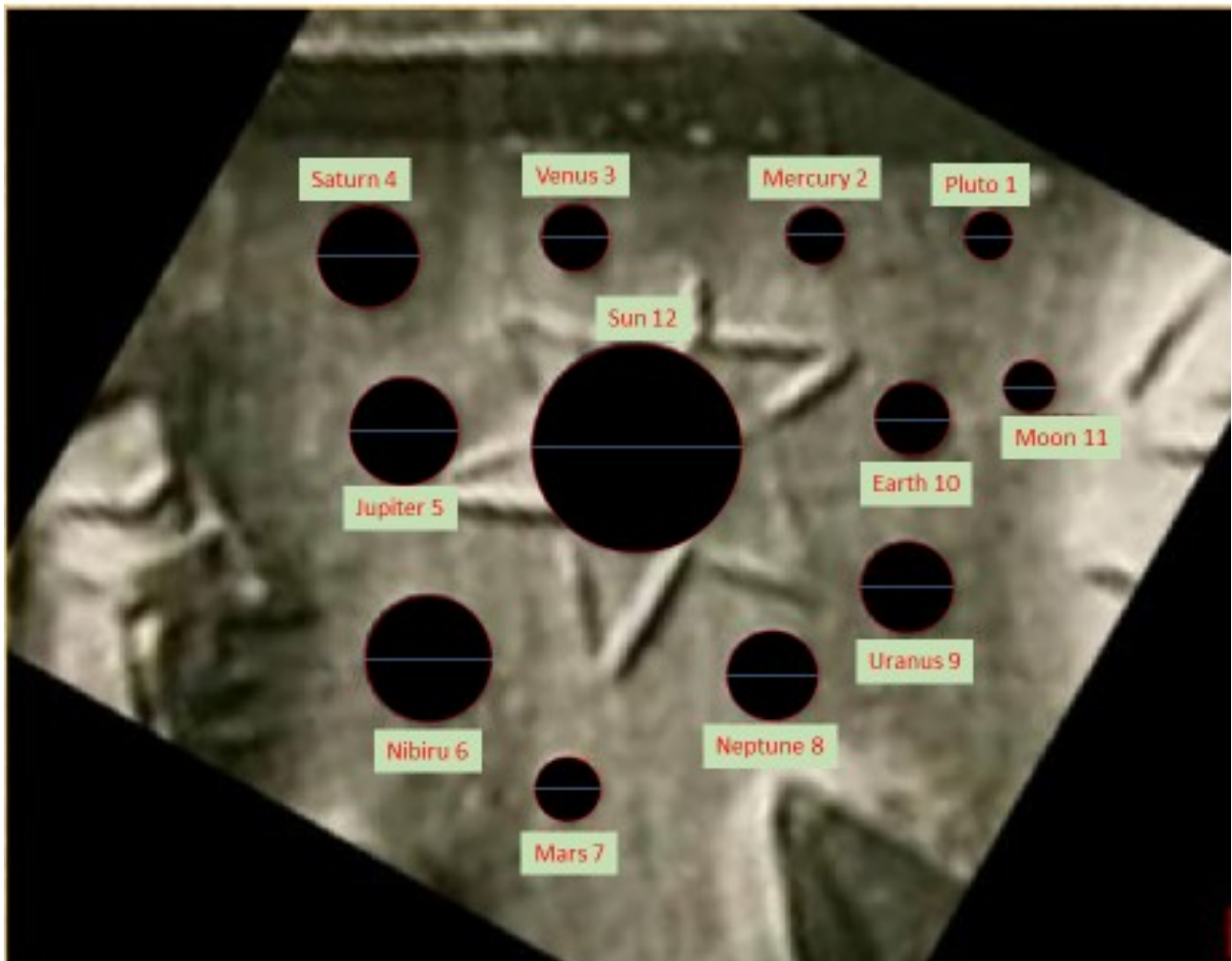
Figure 3: VA-243 Measurement Setup showing Solar System

was recorded as shown in Table 1 below. The Powerpoint measurement only gave me two decimal places of accuracy which is not very good resolution. More resolution will improve the results, but I decided to use the reported values directly and see how the math worked.